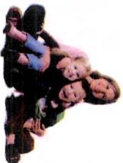
CHART 7: INTERNET ESSENTIALS, GENERIC BR, EXHIBIT 2

For more information, visit our website InternetEssentials.com/partner